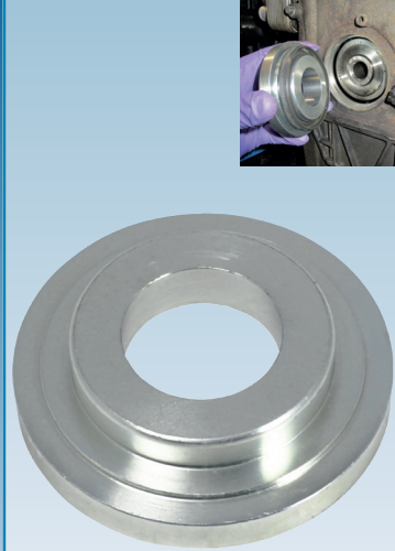
AST5252 CRANKSHAFT SEAL INSTALLER - 1.0 & 1.1 TI-VCT / ECOBOOST - FORD

Equivalent to OE references: 303-1611, 303-1611-01, 303-1611-02