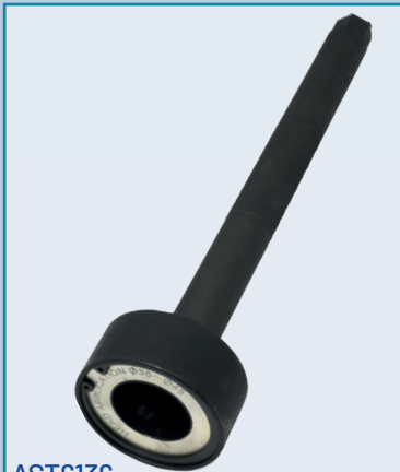
AST6136 TIE ROD END REMOVAL / INSTALLATION TOOL

It is suitable for the removal and installation of tie rod nuts 35-45mm outer diameter.