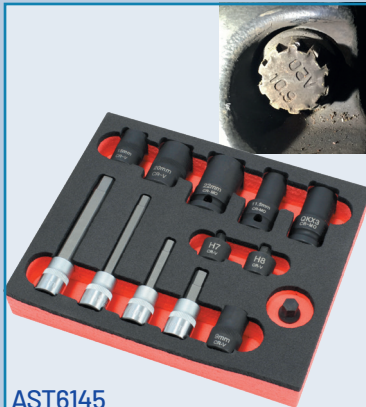
AST6145 BRAKE CALIPER SOCKET SET - 13 PIECE - AUDI - BMW - MERCEDES BENZ - PORSCHE - VW

The through hole allows the tie rod to pass inside the body of the tool, where rollers in the head securely grip the nut of the tie rod in three places, providing a positive connection in order to remove or install the tie rod from the steering rack assembly.