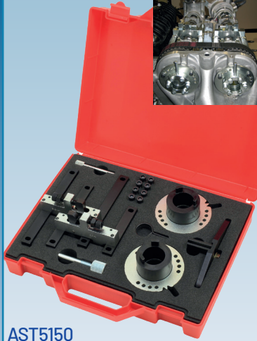
AST5150 PETROL 1.0 SCTI ECOBOOST & 1.1 BELT-IN-OIL ENGINE SETTING / LOCKING KIT - FORD

Designers and manufacturers of Automotive Special Service Tools