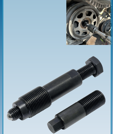
AST6245 VIBRATION DAMPER / CRANKSHAFT PULLEY REMOVAL TOOL - FORD 2.0 ECOBLUE RANGER & TRANSIT / HYBRID MHEV

Equivalent to OE references: 303-1603, 303-1636