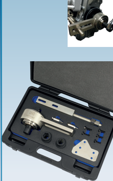
AST6160 5:1 TORQUE MULTIPLIER SET - 1.0 ECOBOOST & 1.1 PETROL ENGINES - FORD

Equivalent to OE references: 21-260, 303-1054, 303-1602, 303-1604, 303-1605, 303-1606, 303-732